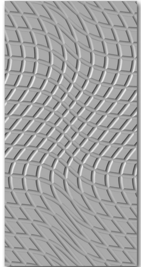
Visible face 2400x1200mm