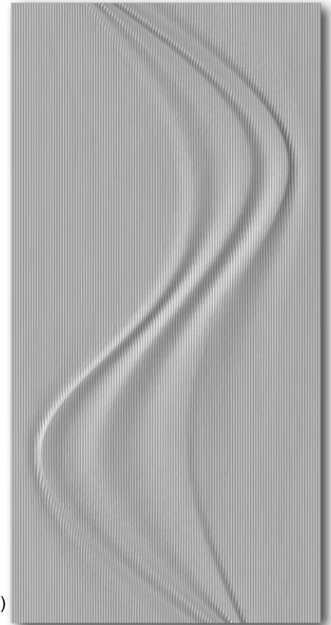
Visible face 2400x1200mm